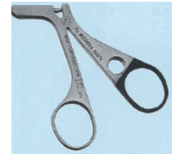
For Mini Clips

※Handle of applier for Mini type is partially black colored.