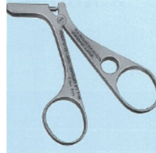
For Standard / Large Clips