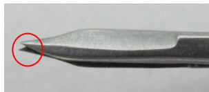
Damage (1) (tips crossing)

(5)-4 Check that there is no damage to the scissor section, as shown in the following figure.