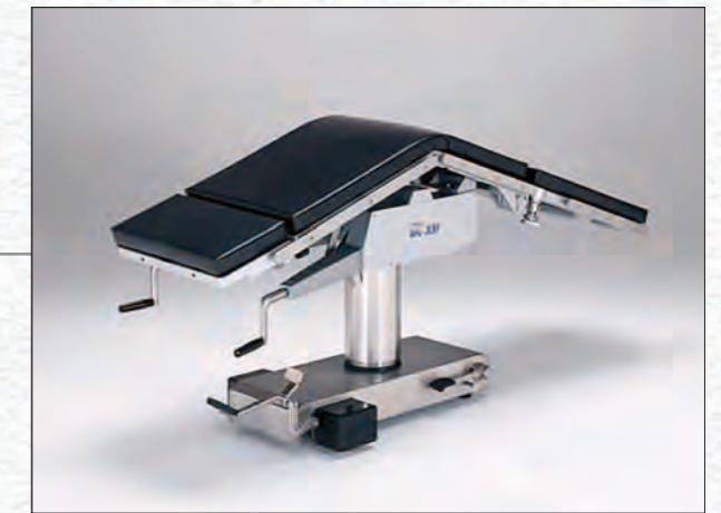
● Kidney position