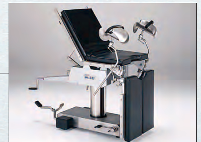
● Urological position