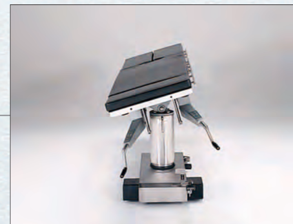
● Lateral-tilt position