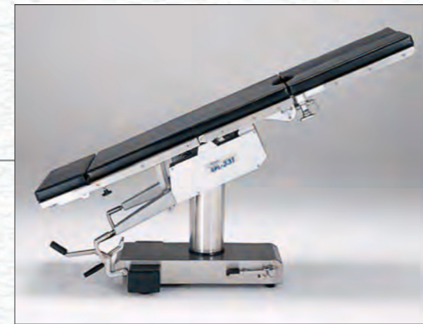
● Trendelenburg position