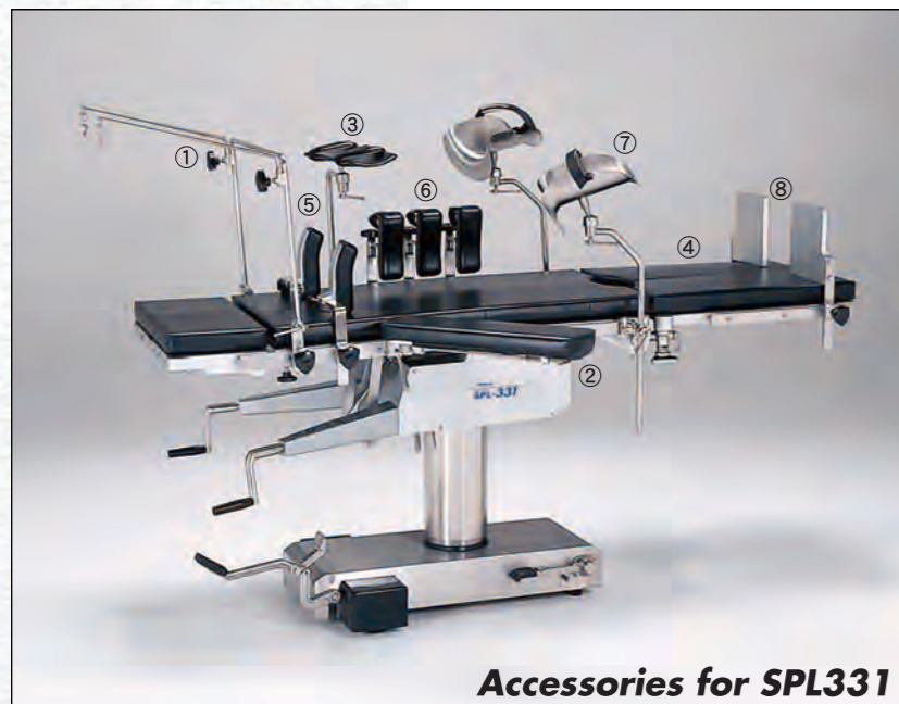
Accessories for SPL331